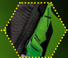
WEBBING COLOR: Hi-Viz