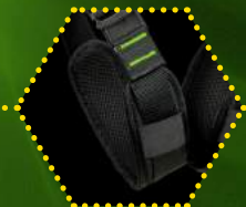
MOVABLE PADS ON THIGHS