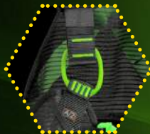
ATTACHMENT LOOP: A/2